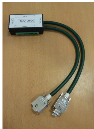
Picture No. 1 REK 100/20